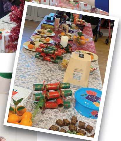
Top: Members ready to tuck in! Above: A fine Christmas spread. Left: The brilliant IMG team