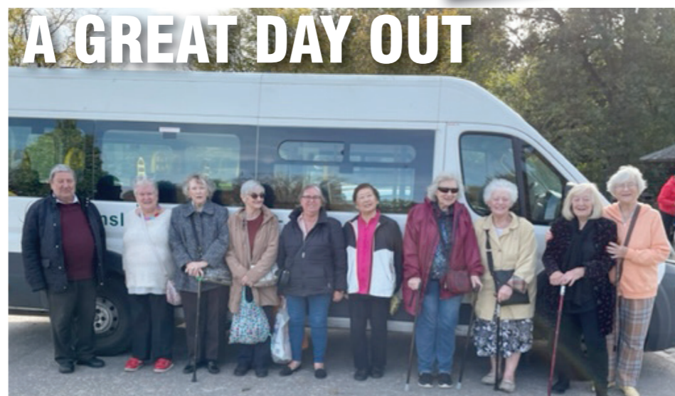
Members really enjoyed the trip to the Longacres garden centre at the end of November. Check our activity calendar for details of the next trip.